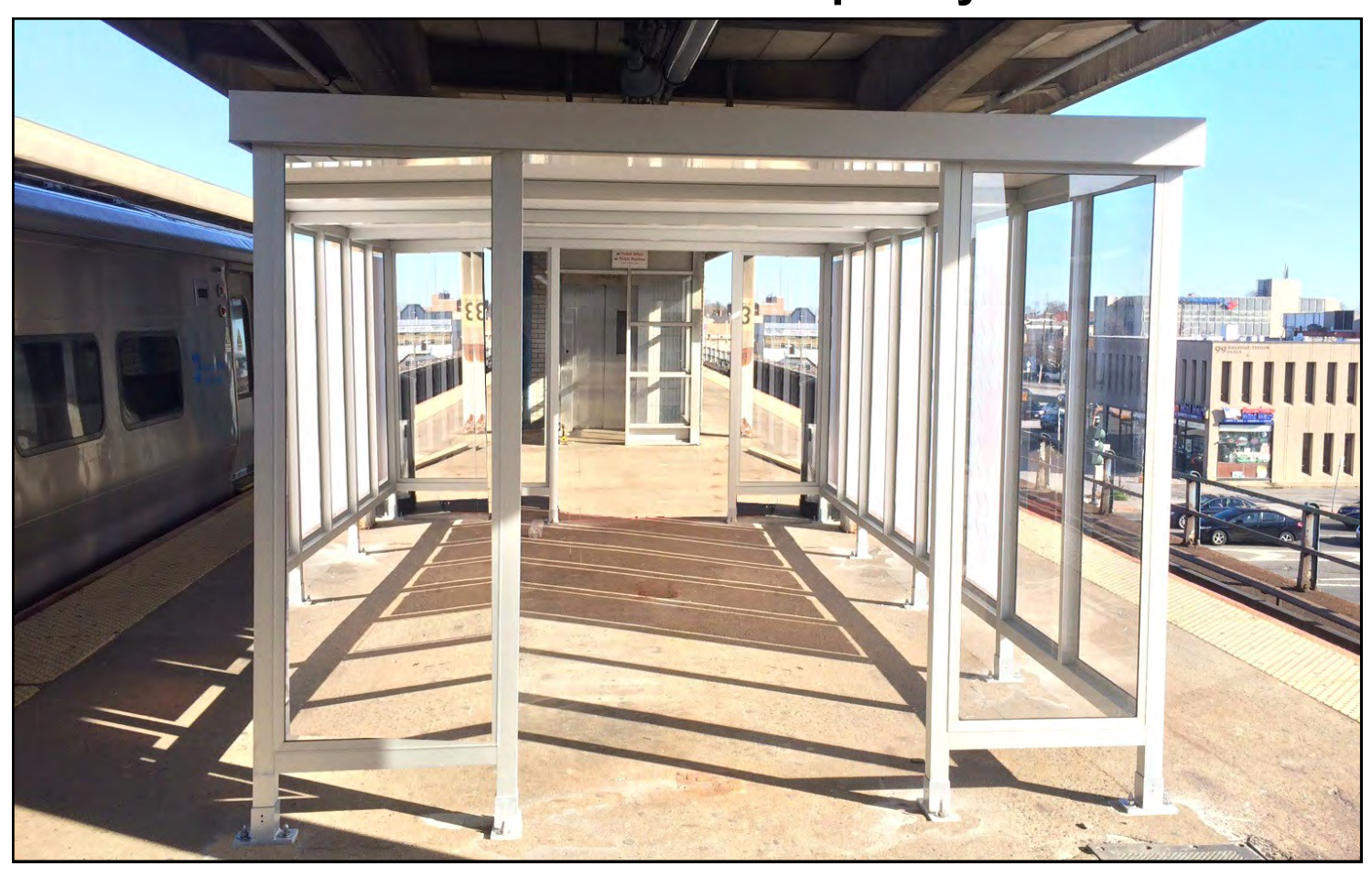
Art for Transit, 57th Street Subway Station